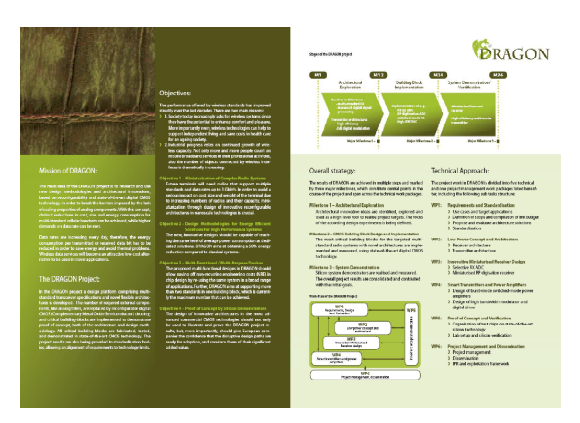
Figure 3: DRAGON folder